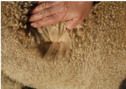
Boztdown Finishing Touch Fleece November 2025