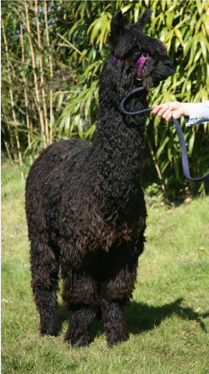
Alpaca Photo 1