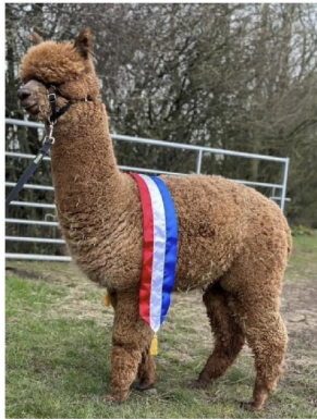
Lane House Miami Heat

2nd Brown Adult Male - 2025 HOEAG Spring Alpaca Fiesta