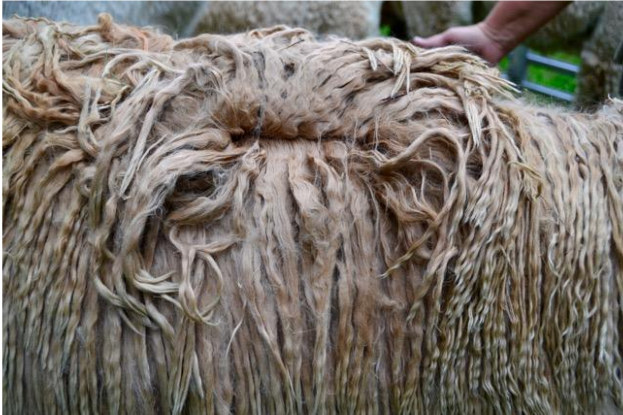
Tolstoy on halter