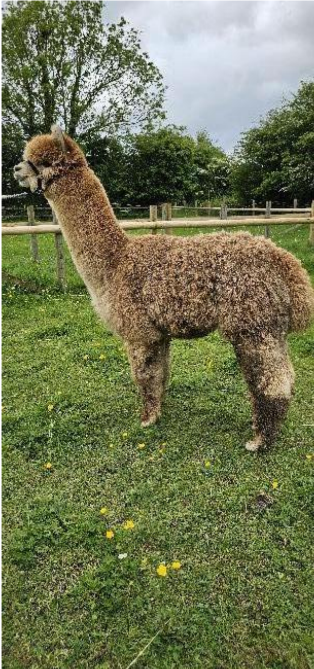
Alpaca Photo 1