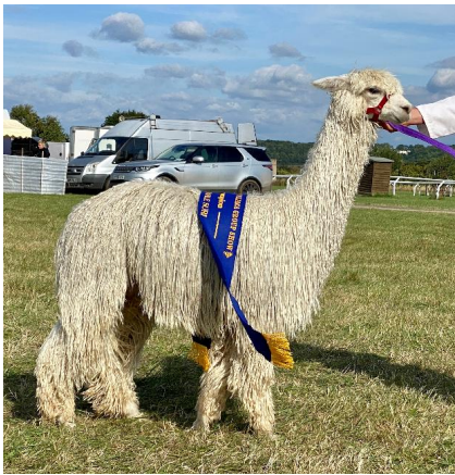
Alpaca Photo 3