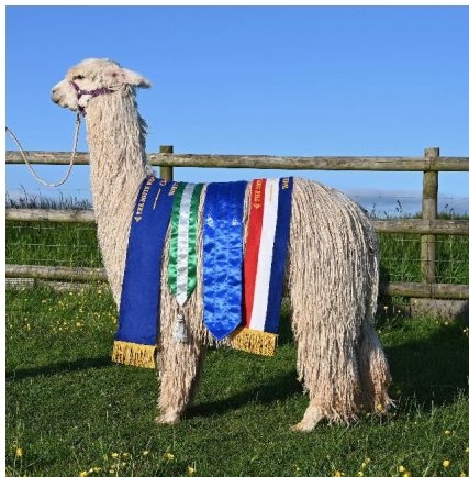
Alpaca Photo 1