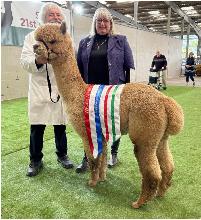
Jack the Lad Supreme and Best of British Midlands 2022