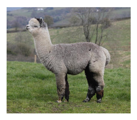
Magellan - 2nd Fleece