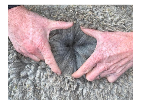
Magellan - 4th Fleece