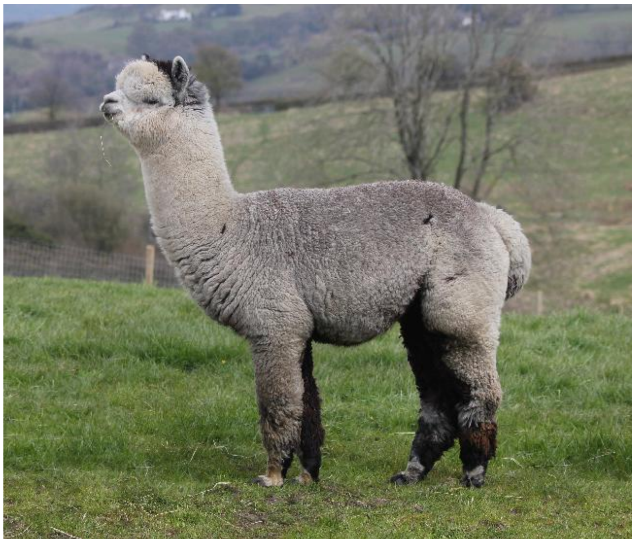
Inca Grey Magellan