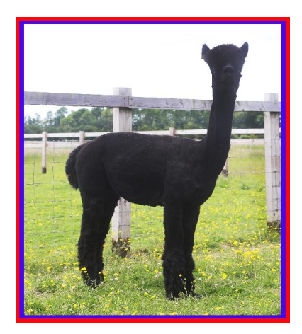
SAMSON AFTER SHEARING