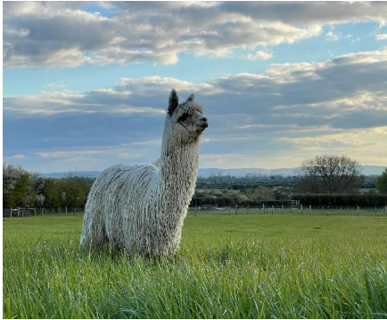
Progeny - 2023 BAS National female champion grey