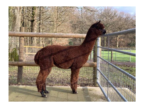
Redens Churchill Fleece March 2021