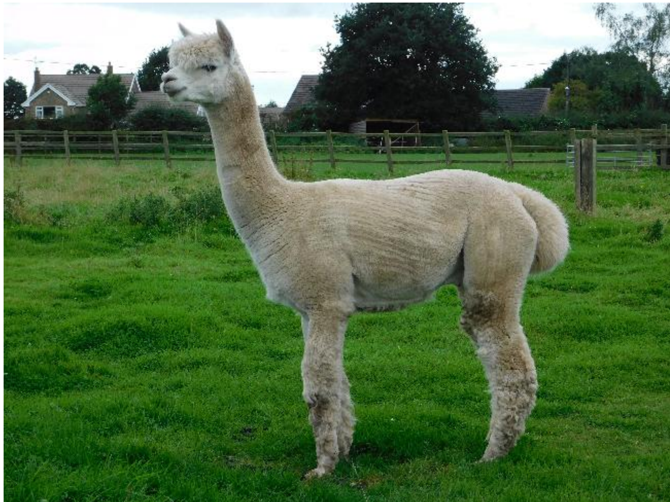
Alpakka bilde 1

Discount for multiple-bookings and in conjunction with our other available studs.