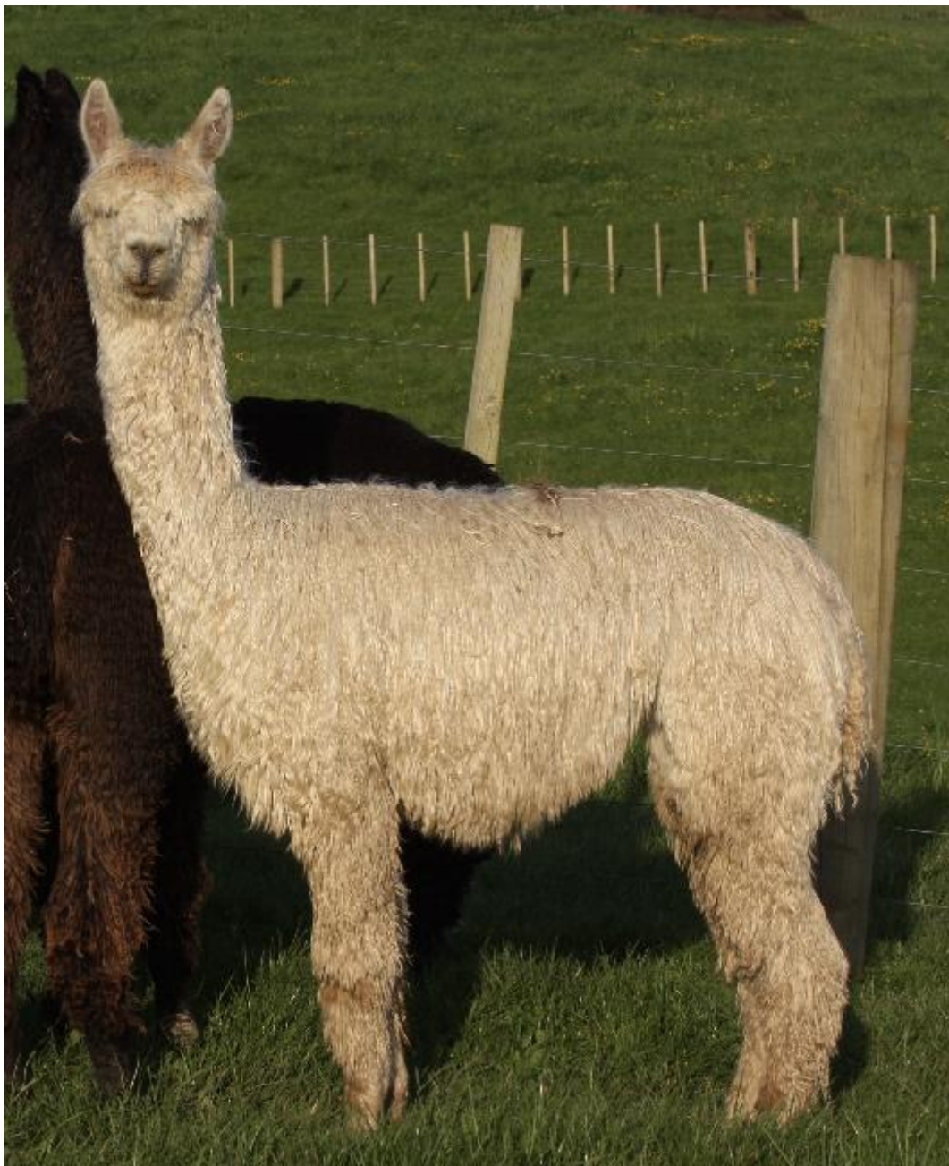
Alpaca Photo 1