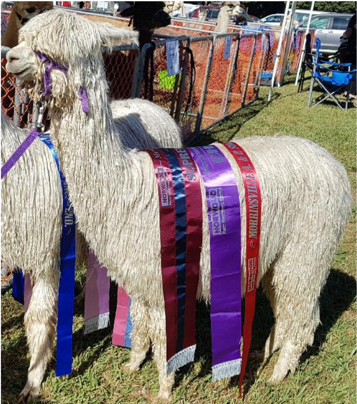
Lorient winning Supreme Suri as a junior at New Zealand Show 2019