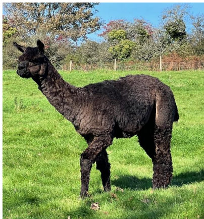
Borasco's progeny, Dark Sky Hnoss with Champion sashes from 2023