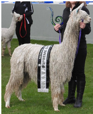
Bolero (Oct 2023)

NZ National Show Supreme Champion Suri 2016