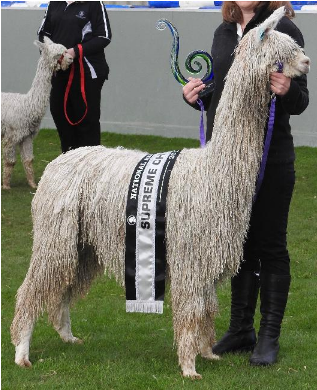
NZ National Show Supreme Champion Suri 2016