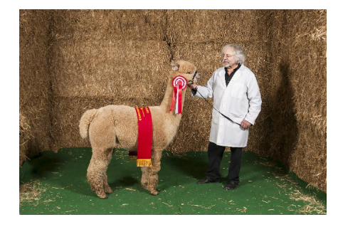
Velvet Voyager 1st UK Nats 2018