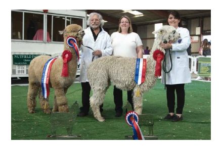
Velvet Voyager HoE Champion