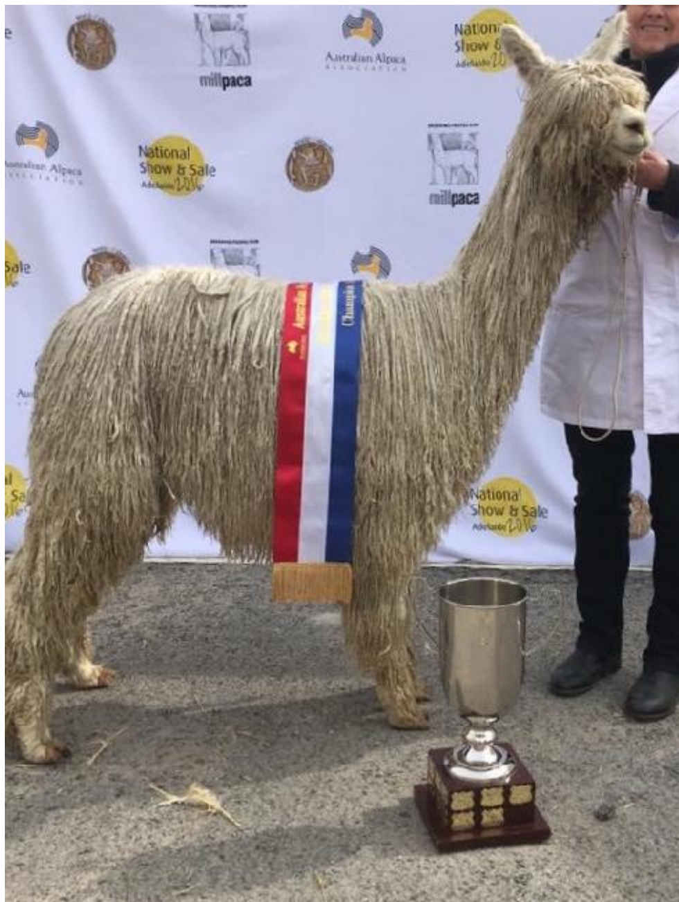
Alpaca Photo 1