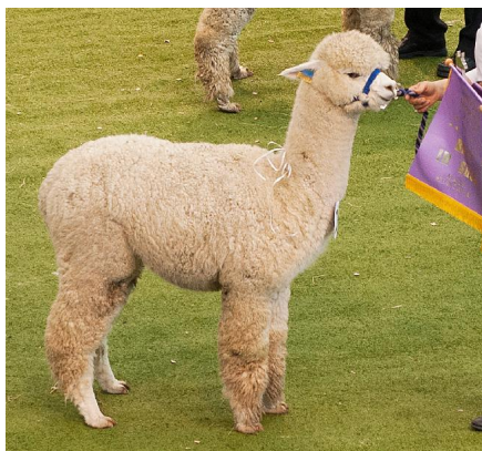
Alpaca Photo 3