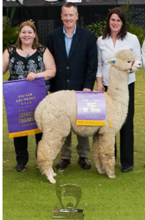
Alpaca Photo 2