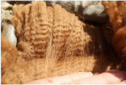
Sample of Romulus' 2nd Fleece