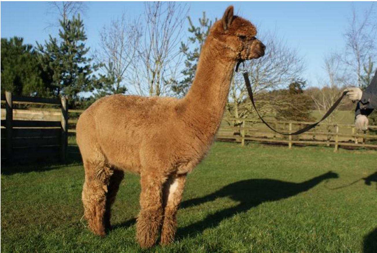
Romulus II - 5th Fleece Feb 2018