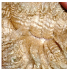
Sandstorm April 2013