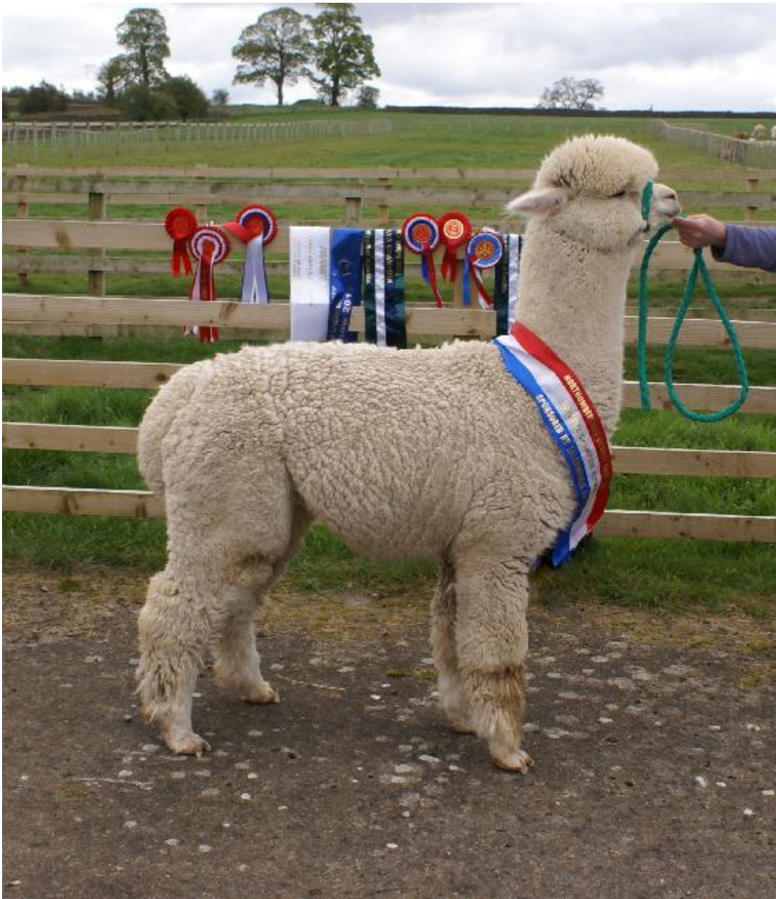
Beck Brow Explorer