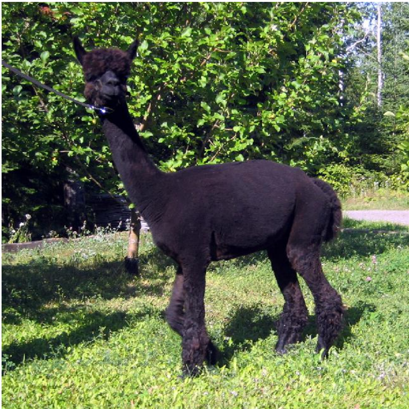
Snowmass After Dark