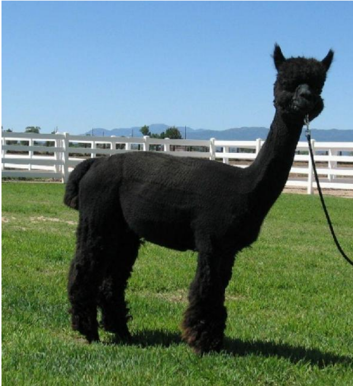
Snowmass After Dark

We are excited to introduce Snowmass After Dark to our herd and to Canada. He has begun his breeding career this summer at Hilltop Oasis Alpacas.