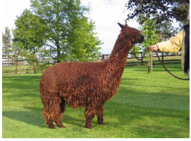
Alpaca Photo 3