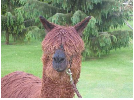
Alpaca Photo 2