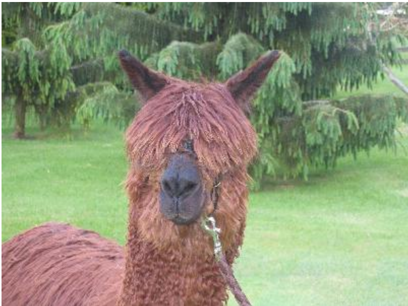
Alpaca Photo 2