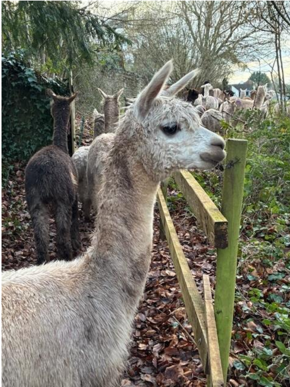
Alpaca Photo 1