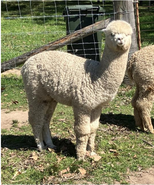
Matara Fleece September 2025