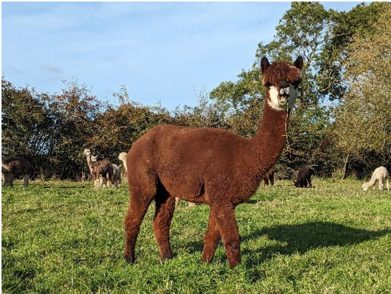
Alpaka Foto 1

We can provide a Tb test at purchaser's cost.