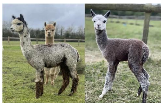
CHAMPIONSHIP WINNING PROGENY

Silver Dream's Championship Winning Progeny