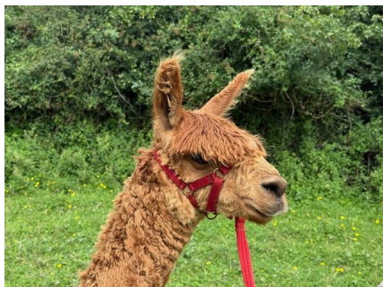
Captain mid side fleece April 2025