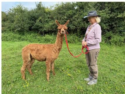
Springfarm Captain August 2025