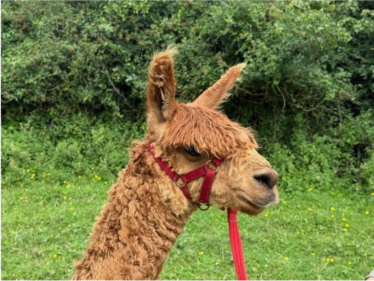
Captain mid side fleece April 2025