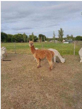
Pumpkin spring 2025