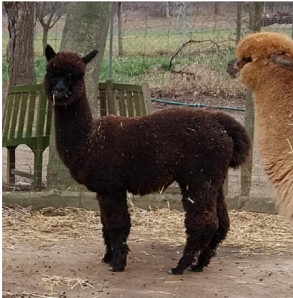
Alpaca Photo 3