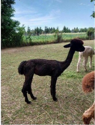
Alpaca Photo 2