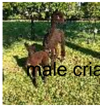
male cria at foot