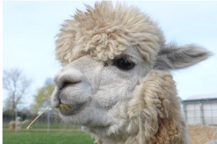
Alpaca foto 2