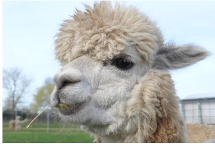
Photo de l'alapga 2