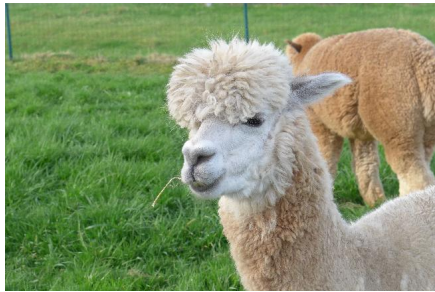
Photo de l'alapga 3