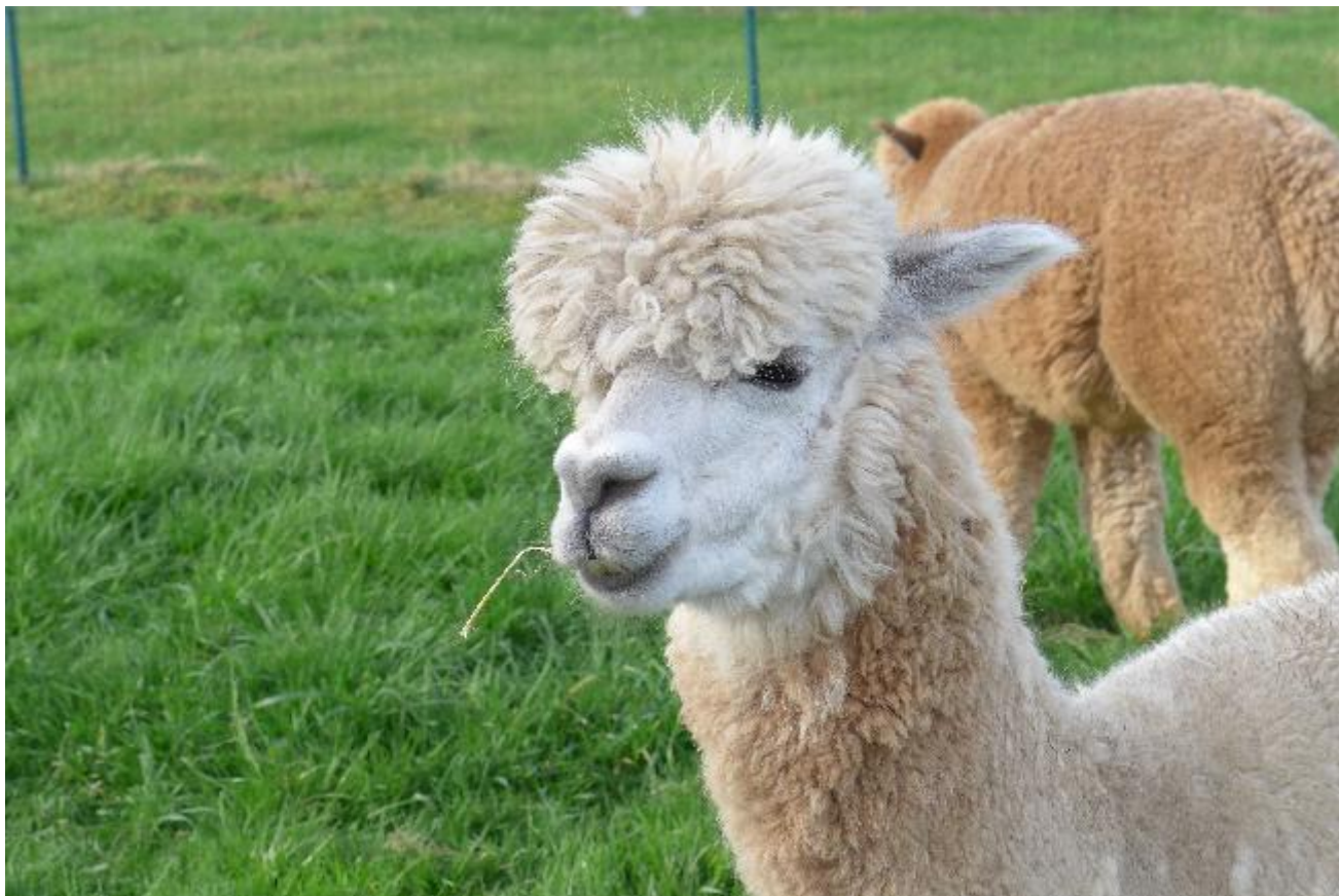
Alpaca foto 3