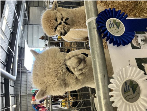
Alpaca foto 3