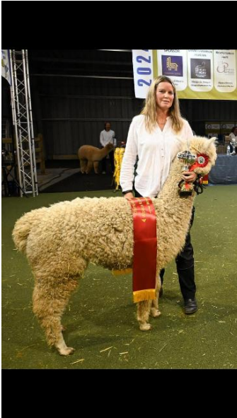
Alpaca foto 2