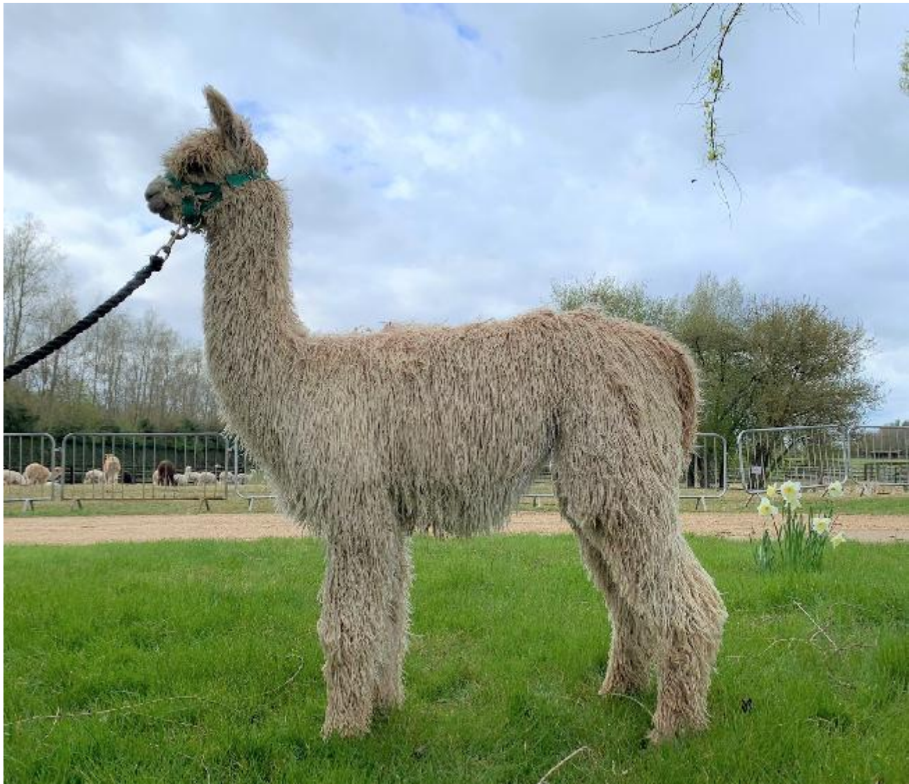
K115 Heirloom 1