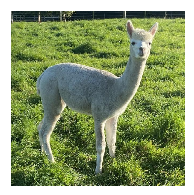
Auld Mill Senga, aged 15 months