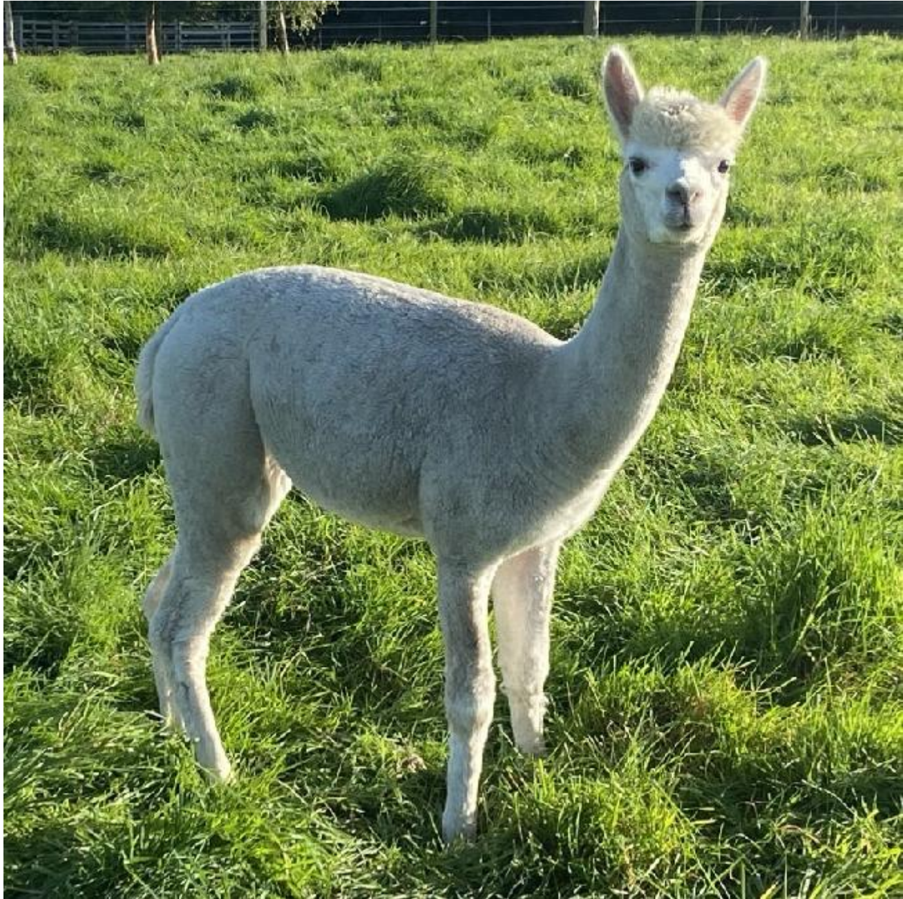
Auld Mill Senga, aged 15 months