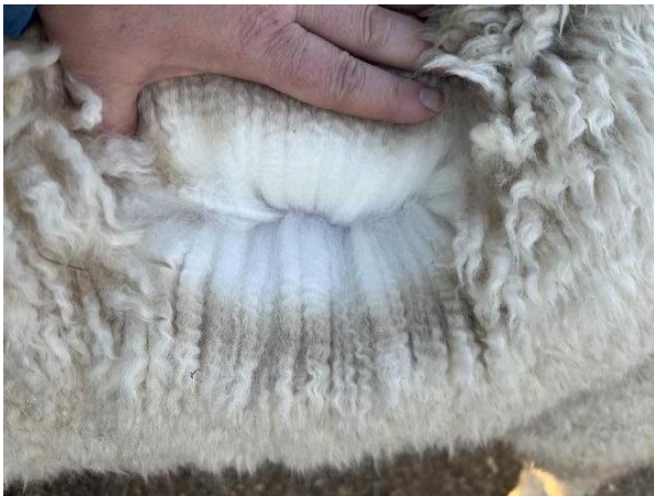
Bozedown Emanuelle Spring 2025