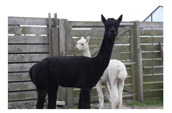
Alpaca Photo 2