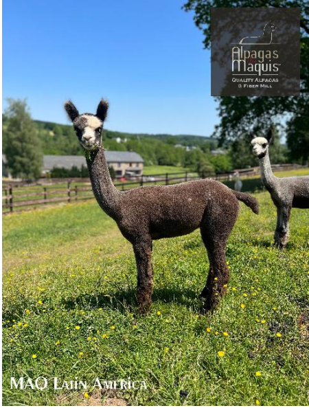
Latin America shorn