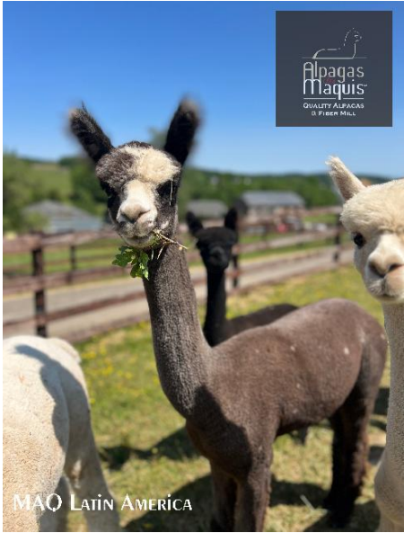
Alpaca Photo 2