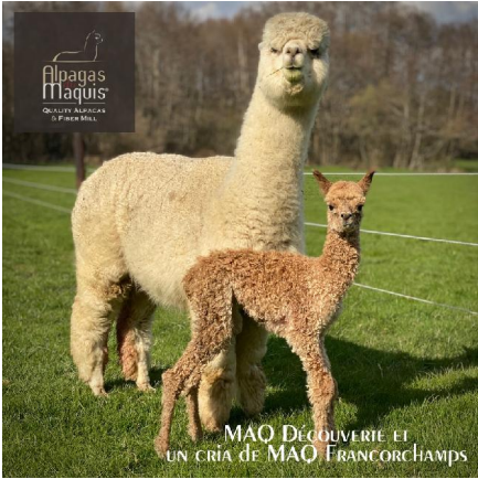
Alpaca Photo 3