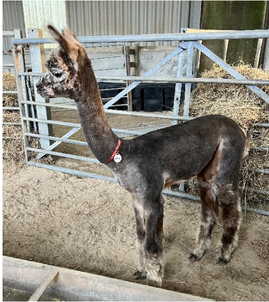
Mullacott Mojito September 2023