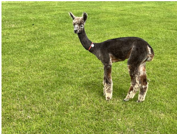
Mullacott Mojito Head