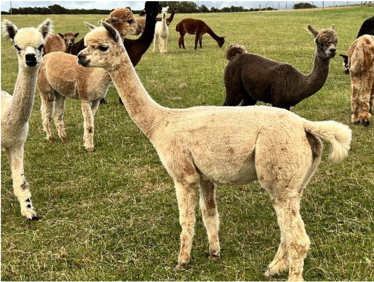
Mullacott Pi side