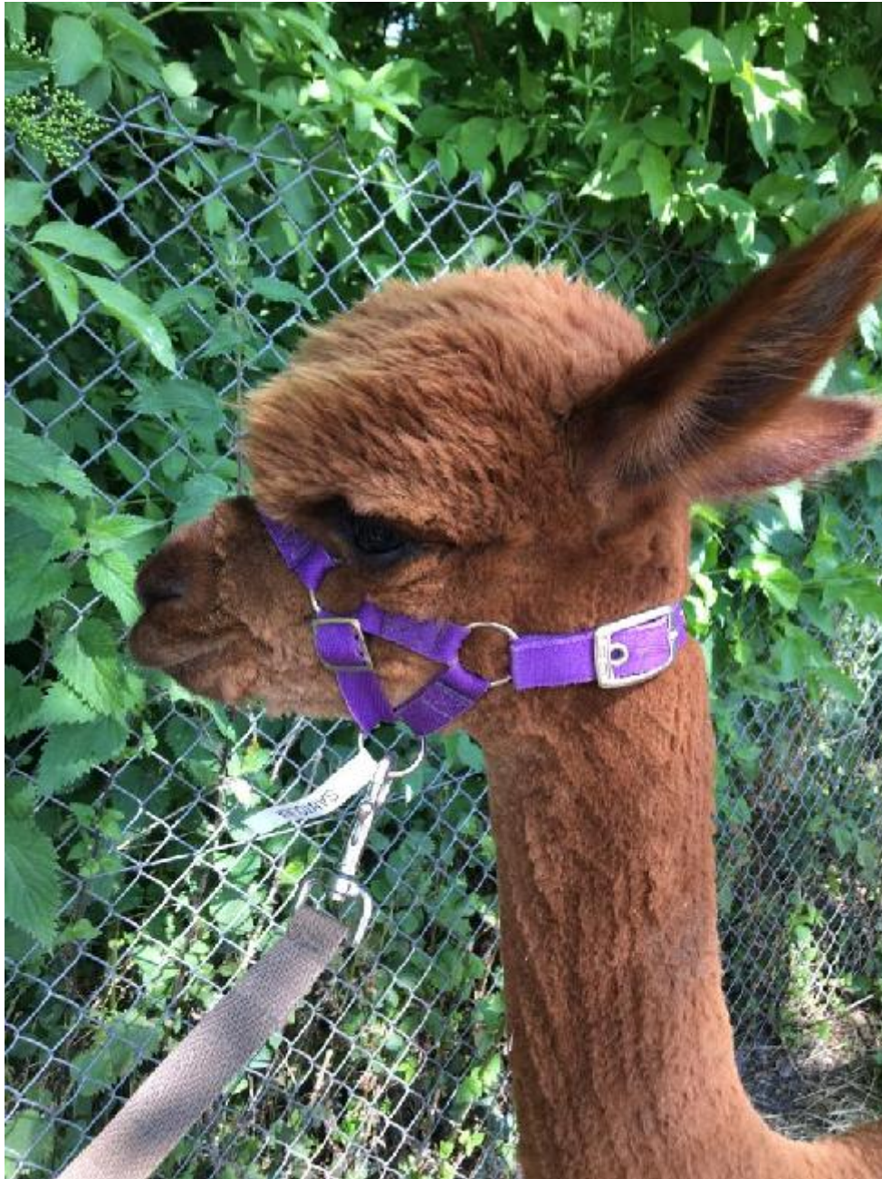
Hensting Honeysuckle Head

In summary, Hensting Honeysuckle, with her captivating Dark Thorn coat, halter training, soft fleece, and impeccable pedigree, embodies both beauty and functionality. Whether you are a discerning alpaca enthusiast or a breeder seeking to enhance your herd's genetic diversity, Hensting Honeysuckle is a treasure that is not to be overlooked. Embrace the opportunity to welcome her into your world and let her grace and magnificence elevate your alpaca journey to new heights.